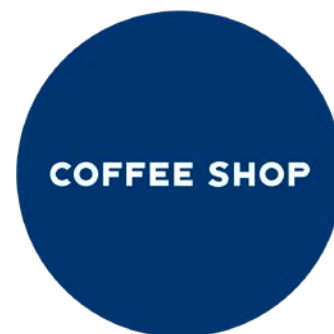
CAFÉ COFFEE SHOP